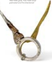
1 DOUBLE-COCOON Ring 935/1000 gold, 935/1000 silver patinated and fire blackened

1 This set of cocoons is created by the process of creation itself. Each piece grows like a real cocoon in nature. In human life, a cocoon often symbolizes a safe environment that allows growth, change and protection from external threats. This ring is a combination of two cocoons, silver and gold: it shows also that the forces complement each other. The fire-blackened part tells of the forces that can work here. Height 4 cm.