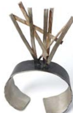
BARRIER Bracelet 935/1000 silver natural-colored diamonds, 999/1000 gold inside

7 This work lifts the simple into its proper place. Since aquamarine gives, among other things, vision and foresight, so that one can always see new paths and possibilities and include them in their plans (Gisenge), this beautiful faceted gemstone is set almost free-floating. The gold grounds it, the drop shape of the ring refers to water (at.fall, aqua marina) and so fluidly combines these two elements.