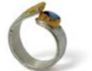
THE LANGUAGE OF THE GALLOPING HORSE Ring 935/1000 silver, 999/1000 gold 935/1000 gold, bovalde-opal

6 An inscription of pure gold - a spontaneous, intuitive writing. This writing tells of a great animal, perhaps a horse or a bull, galloping into new territories, without haste, but with joy and energy. The result of this imaginary journey is found at the other end of the open ring in the form of a rock opal. Here the traveller has arrived and can rest in the dreamlike play of opalescent colours of the gemstone, grounded and strengthened by its mother rock.