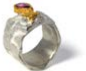
2 NATURAL DROP Ring 935/1000 silver, 999/1000 gold 935/1000 gold, untreated 1.36

2 A powerful composition. Three elements - one ring, Almandine in the form of a drop, pure gold, light-colored silver. This composition is enhanced by its structure, reminiscent of rocks... The rock in the surf? Carried, this work can make feel great confidence. Almost luminous confidence. Rock solid dynamics. This ring looks rough and has a heavy weight, and yet it is so soft and pleasant on the finger.