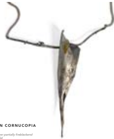
3 COCOON CORNUCOPIA Necklace 935/1000 silver partially fireblackened 999/1000 gold

3 This design stands for abundance and transformation, and is a uplifting reminder that with the right attitude, anything is possible. A main feature of this necklace is the flower design made out of pure gold. This jewel body opens to the sky, symbolizes divine receiving and fertility. The silver chief material stands for purity. The silver has been patinated and fire-blackened to show the power and forces of transformation. Created to celebrate the greatness of all. Length Middle-Cocoon 20 cm.